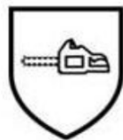
Chainsaw protection. Class 2