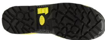
RUBBER / POLYURETHANE sole Slip resistant, antistatic, oil resistant sole.