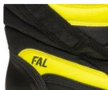
Ankle protection Fire resistant reflective strip Double seam