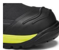
Rubber external toecap protection