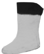
Crosstech ® lining Bootie format