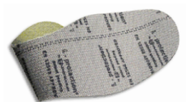
High tenacity polyester Insole (P)